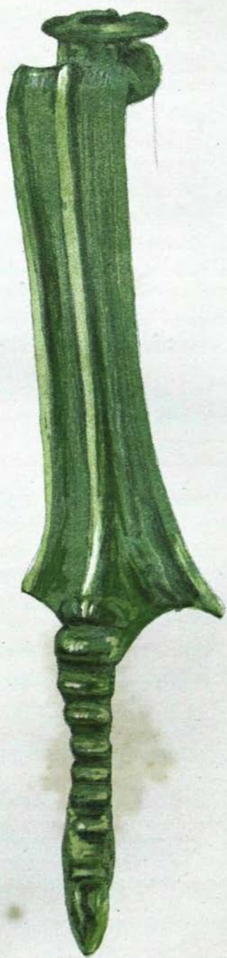
The Medallion and Handle same size as Original.