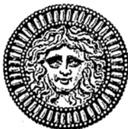
Fig. 1 a .

the lid, the sides, and the ends. The raised mouldings are, uniformly, composed of alternate narrow rings and long beads. Each long bead is thicker in the middle than at its extremities, both of which are invariably capped by one of the narrow rings. By means of this moulding,* the lid is divided into several rectangular compartments, within each of which it is again used in the shape of an X. Every one of the triangular spaces, thus formed within the rectangular divisions of the lid, contains a medallion of Medusa's head, as shewn in Fig. 1, and enlarged, in Fig. 1 a . Within this coffin, lying upon the left